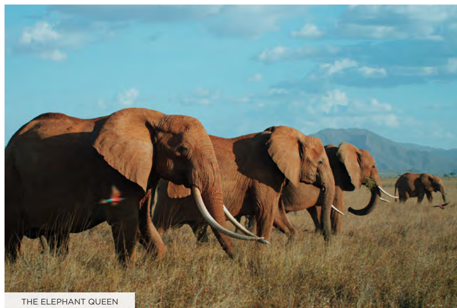
THE ELEPHANT QUEEN