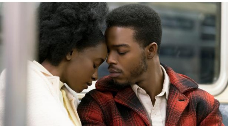
IF BEALE STREET COULD TALK