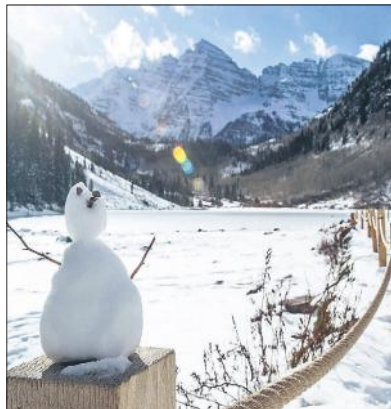
A tiny snowman sits on a fence post at the Maroon Bells on Thursday afternoon. The road to the Maroon Bells will officially close Thursday unless snow conditions create reason for early closure.