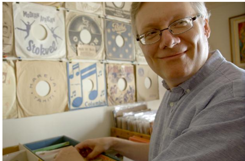
BATHTUBS OVER BROADWAY