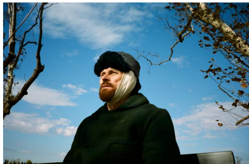
AT ETERNITY’S GATE