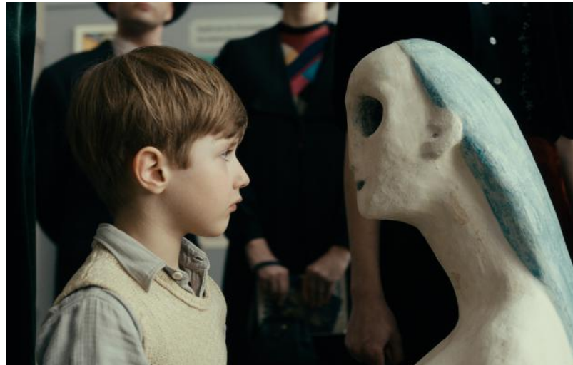
NEVER LOOK AWAY

FILM COURTESY OF | Sony Pictures Classics