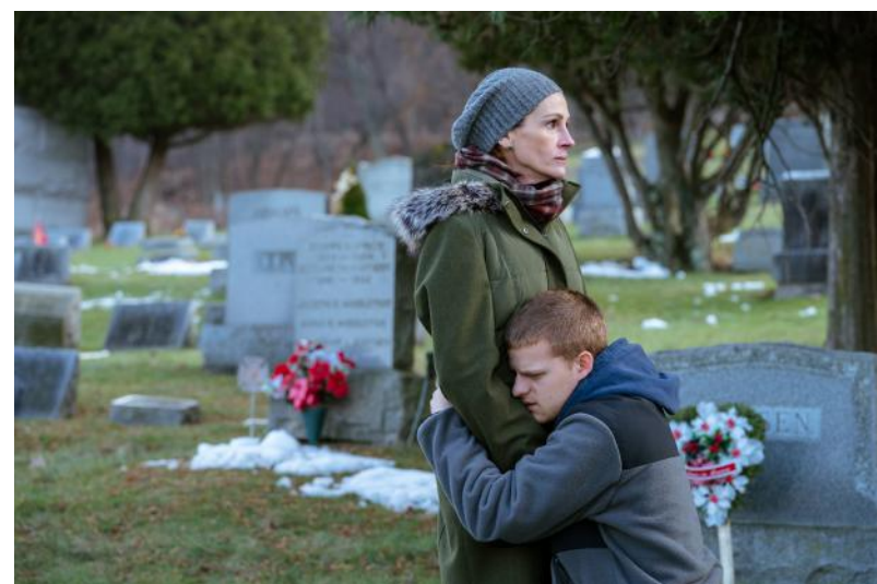
BEN IS BACK