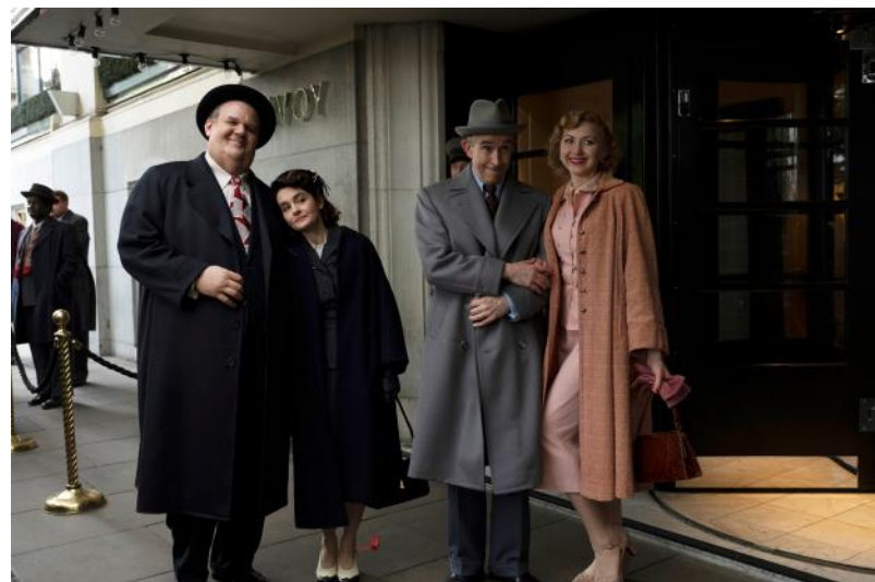
STAN &amp; OLLIE

FILM COURTESY OF | Sony Pictures Classics