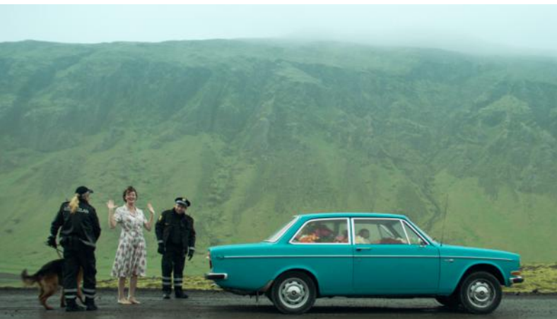
WOMAN AT WAR