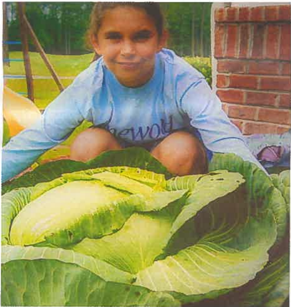
The Starfish Throwers

8:00PM GLOBAL VISIONS Crystal Theatre Living Is Easy With Eyes Closed see page 5