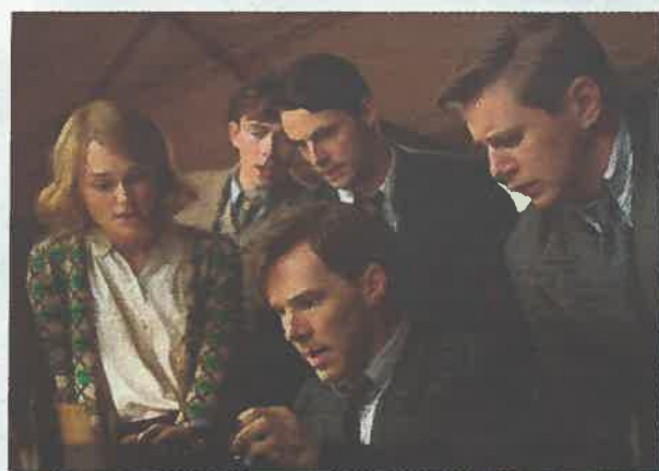
The Imitation Game