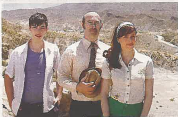
Living Is Easy With Eyes Closed