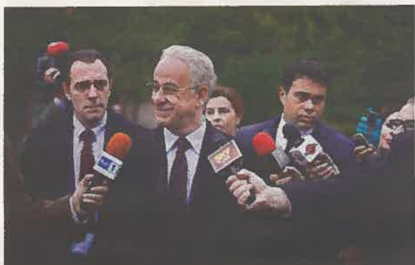
Viva La Libertà