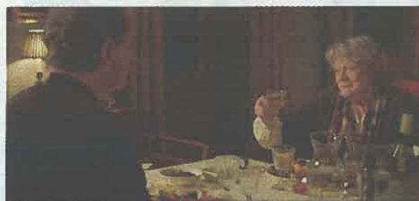
My Old Lady