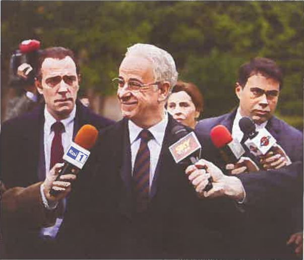
Viva La Libertà