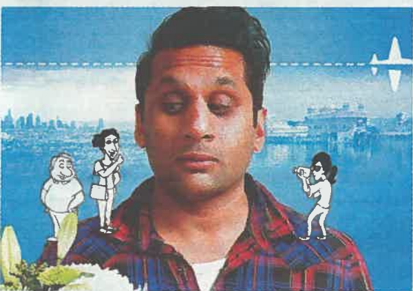
Meet the Patels