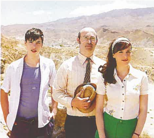
Living Is Easy With Eyes Closed