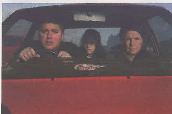
Life's a Breeze