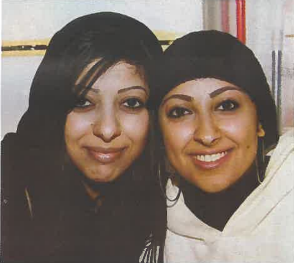
We Are the Giant