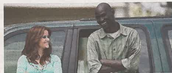
The Good Lie