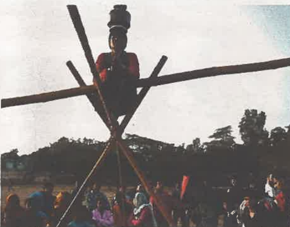
Tomorrow We Disappear