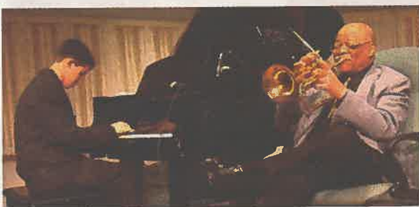
Keep On Keepin' On