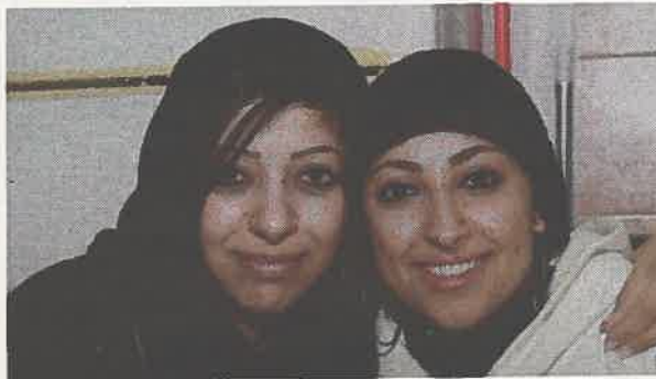
We Are the Giant

5:30PM OPENING NIGHT DOCUMENTARY PRESENTATION