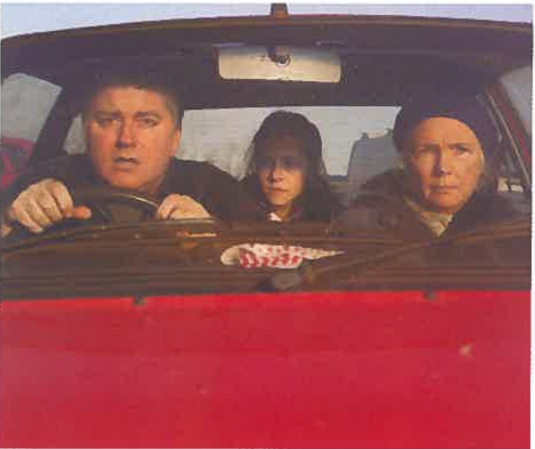
Life's a Breeze