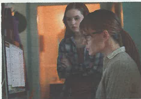
Men, Women & Children