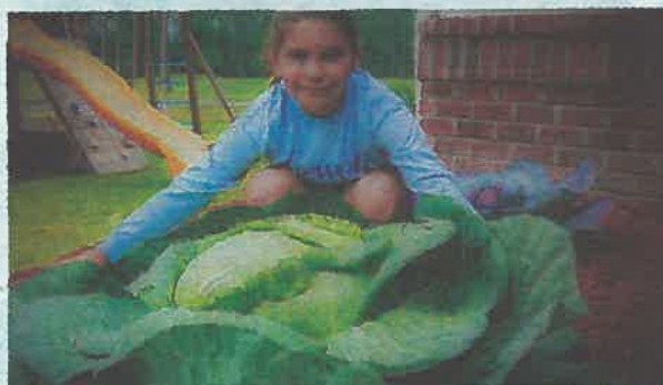
The Starfish Throwers