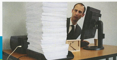
Strange World of Max X.: Office Work