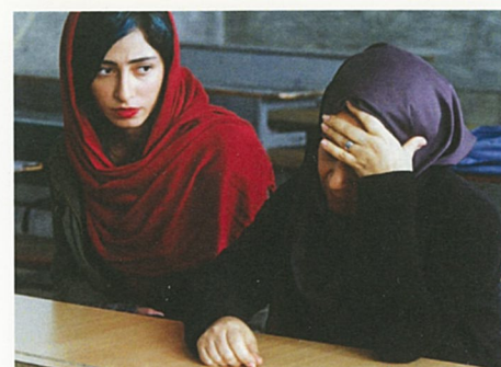
After the Class