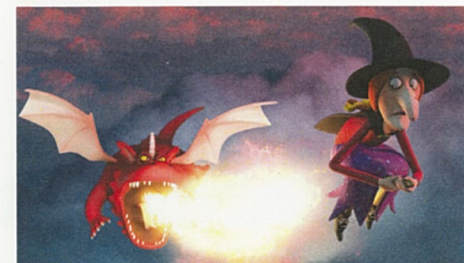
Room on the Broom

The Strange World of Max X.: The New Camera See Competition Program Nine for information