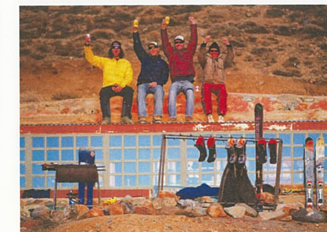
Vaya a la Cumbre

Wheeler Opera House 95 min. followed by filmmaker Q&A Program order to be announced