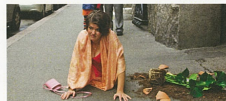
Do I Have to Take Care of Everything?