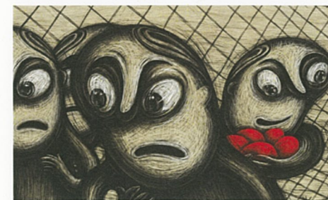
Kali the Little Vampire