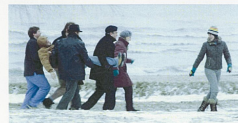
Best if Used By